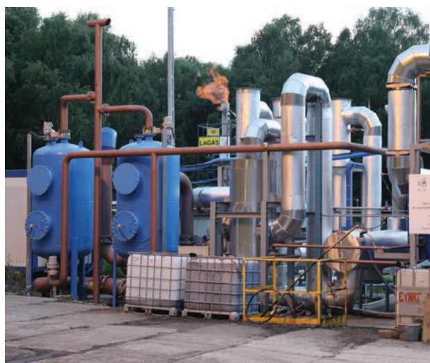
Fig. Installation for pressure simulation of the underground coal gasification process

Demonstration facility of UCG is the last stage before the implementation of technology on an industrial scale. The area of application is hard coal mining, especially within the USCB in areas where mining operations are terminated for economic or natural reasons (too great depth of resources) as well as power industry, particularly heat and electricity generation in medium-power type systems for local applications.